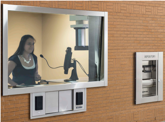
3' x 5' Window

Windows pair easily with Hamilton's Transaction Drawers. The drawer and window are designed to be used together, but can be installed separately to replace existing equipment in both drive-thru and walk-up applications.